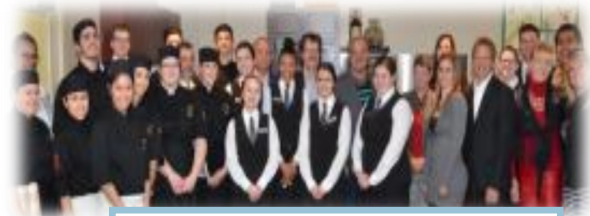
Hotel management - Campus Héritage