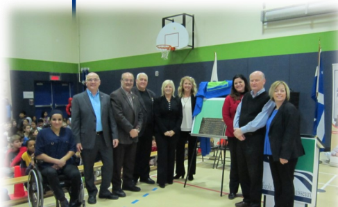
Expansion of Deux-Ruisseaux School