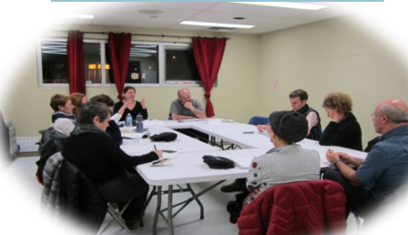
Meeting of people in forming an association in Val-Tetreau