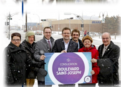
Major works on Saint-Joseph Boulevard - 4 year project