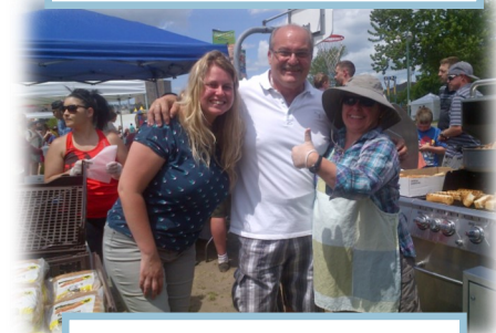
Soupe populaire festivities