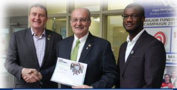
Hero of the perseverance in school