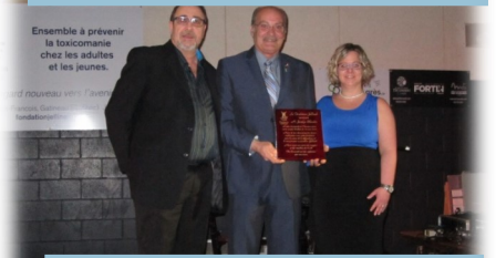
Honorary President of the Jellinek Foundation Benefit dinner