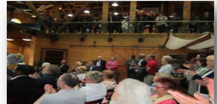
Center for ecology and Urban agriculture in Gatineau