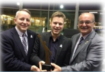
Union of Quebec Municipalities Award -- Youth Commission Project